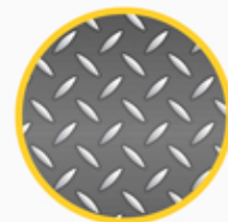
Stainless Steel Units